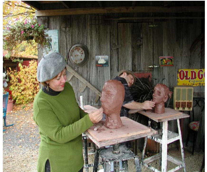
Sculptor at work display