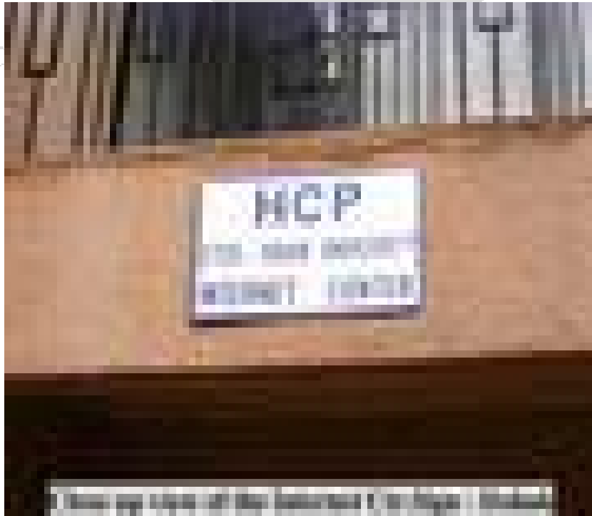
New Internet Center in Duhok