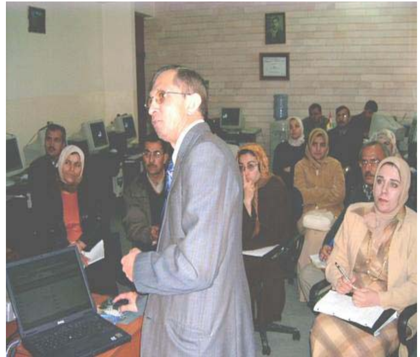
Faculty development for nurses in Erbil