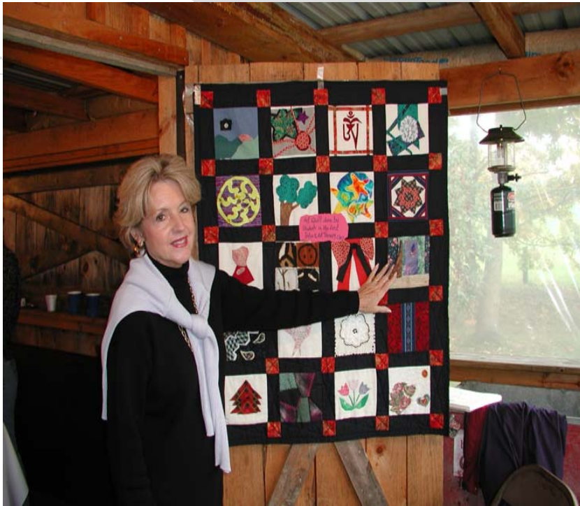
Exhibit from Art Therapy course