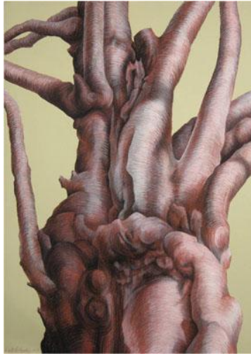
Crab Apple: Johnson City, TN