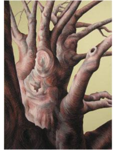
Oak: Johnson City, TN