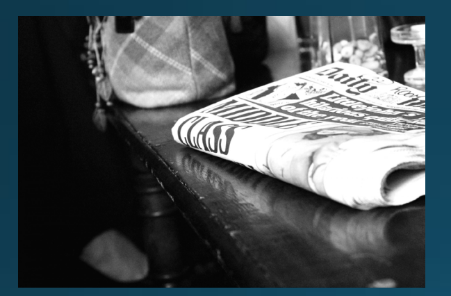
Communicate with public: Teaching @ ETSU