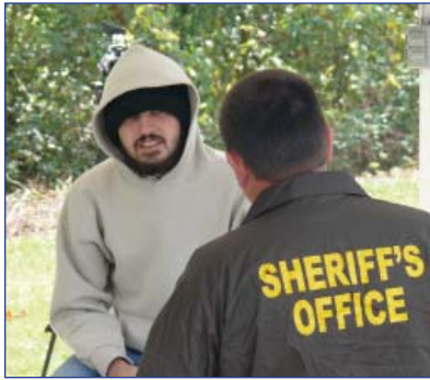
In these photos, ETSU's Roving Artists serve as actors for law enforcement training scenarios.

Recently, law enforcement officers from ETSU, Johnson City, Washington County, Elizabethton, Bristol and Carter County participated in such a training session, with assistance from students in the Arts Scholars Program within the Honors College. Arts Scholars are talented students carefully selected for a specialized curriculum, including a unique Roving Artist course that allows participants to take cooperative projects onto campus and into the community.