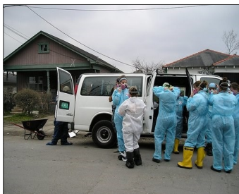
ETSU students on community service.

For information on the Concentration in Regional and Community Studies, contact: