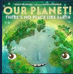
Our Planet! By Stacey McAnulty

In celebration of Earth Day, we have included a few of our favorite titles as recommended reads. Enjoy!