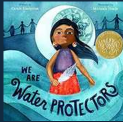
We Are Water Protectors By Carole Lindstrom