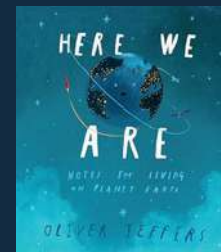
Here We Are By Oliver Jeffers