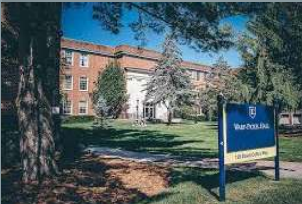
The America Reads office is located at 307, Warf-Pickel Hall