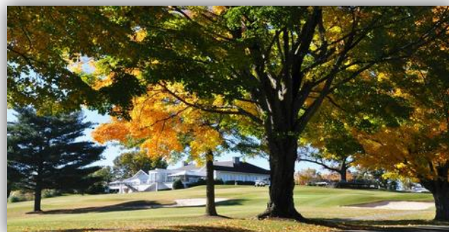
Johnson City Country Club

28th Annual Meeting & Brunch Friday, October 30, 2015 11 a.m. - 1 p.m.