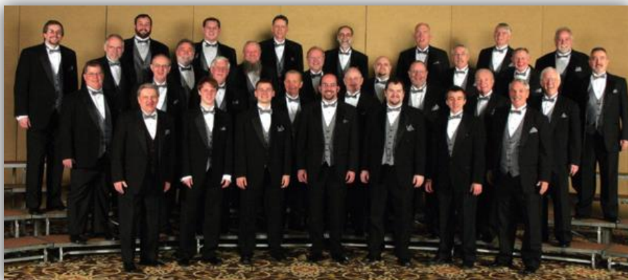
Music: Men of Note from the Appalachian Express Chorus