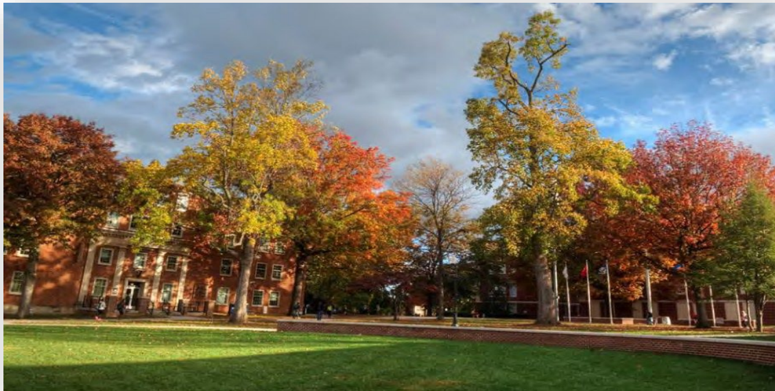
The Quad in early fall.