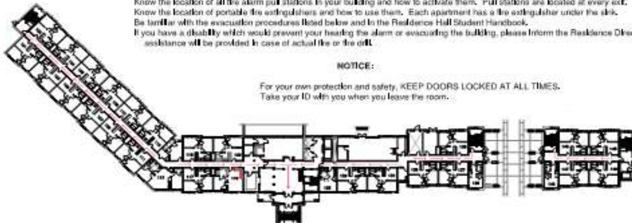
FLOOR PLAN-FIRST FLOOR LEVEL

For your own protection and safety, KEEP DOORS LOCKED AT ALL TIMES. Take your ID with you when you leave the room.