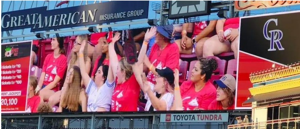
Upward Bound students on the Jumbotron during last summer's trip to Cincinnati! We are so excited for UB Summer 2025