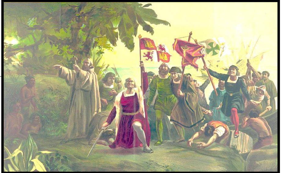
Image Source: Public Domain, Library of Congress, First landing of Columbus on the shores of the New World, at San Salvador, W.I., Oct. 12th 1492 , Dióscoro Teófilo Puebla Tolín