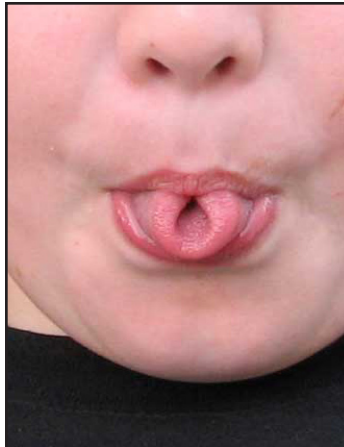
Can roll tongue