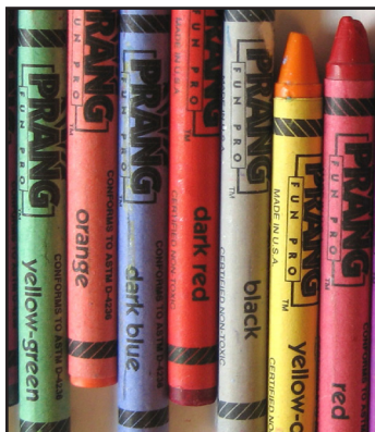
Can see red & green