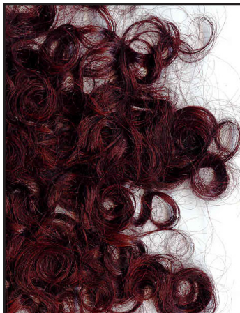
Naturally curly hair