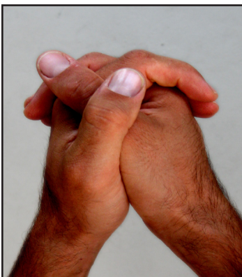
Cross left thumb over right