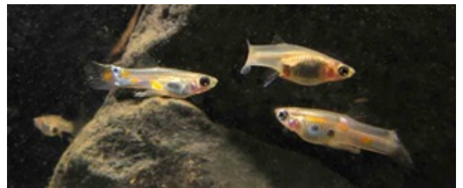
Reznick's study of Trinidad guppies revealed that the fish can evolve rapidly.

The results of his federally funded study prompted what he calls one of his proudest moments in science: a National Enquirer story with the headline, “Uncle Sam wastes $97,000 to learn how old guppies are when