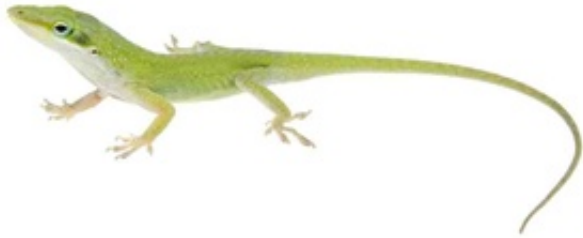
Green anole lizards adapt to the invasion of brown anoles in only 20 generations.